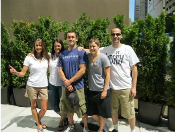
One more TT Team photo before we were off to the airport.