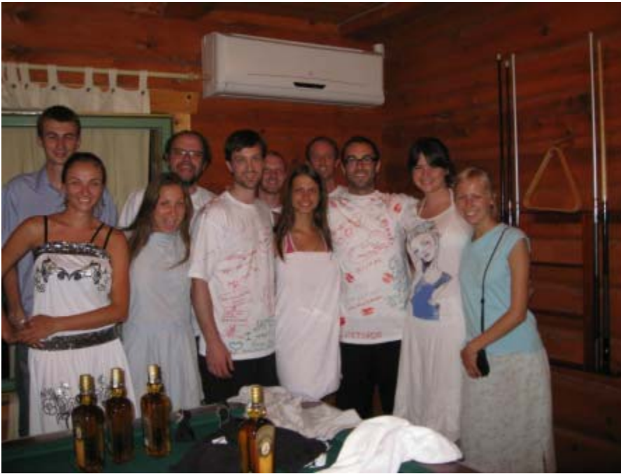
Some students and camp instructors at the surprise party.

10pm – After the presentation ceremony, everyone jumped in the giant sauna or hot tub, and then a group of us went down to the lake for some night-swimming.